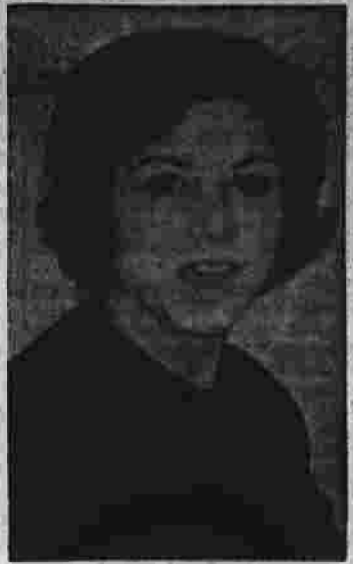
Yuro before and after.